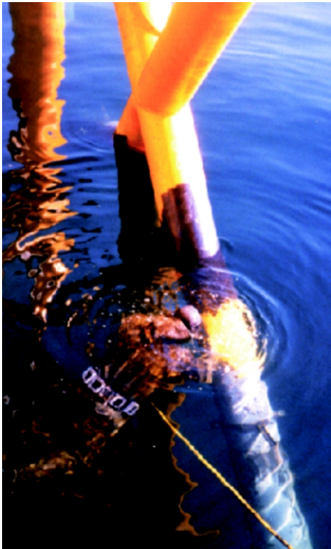
Top left: A diver prepares the surface for coating using grit-blasting equipment. Top right: The coating is applied by hand brush straight from the tin. First, an index coating of black followed by a top coat tinted to match the original polyurethane. Bottom left: The finished repair is indistinguishable from the rest of the structure. Bottom right: Underwater, the leg can be seen to be fully coated and protected.