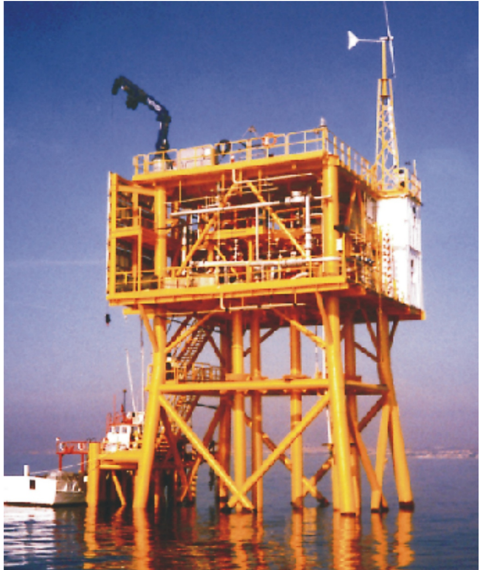
Above: The small platform in its idyllic coastal setting. At the sea level, exposed areas of the legs and struts that should have been submerged can clearly be seen without the yellow polyurethane top coat.

Alocit 28.15 was chosen for its outstanding performance in wet and moist conditions, its long-term record around the world in environmentally sensitive areas and for its ease of use.