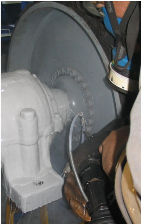
Above: Spraying Enviropeel on to a refurbished pulley housing.